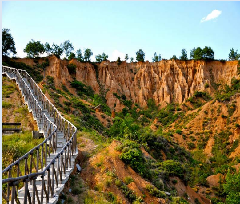
Geo – Park at Bouharia