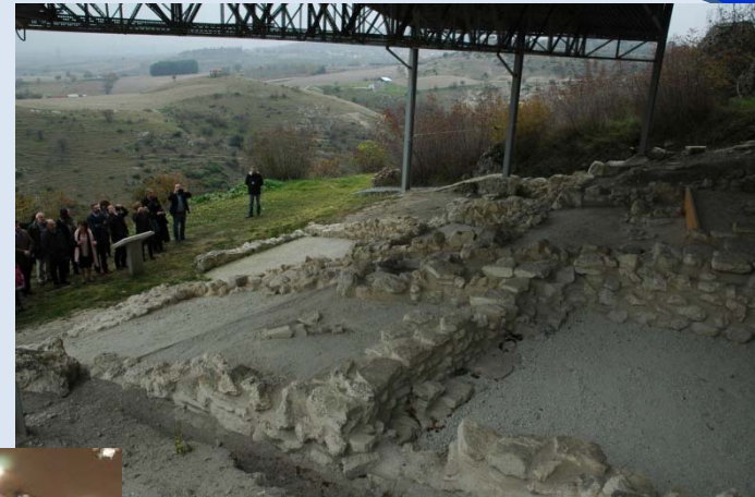
Archaeological Site at Aiani