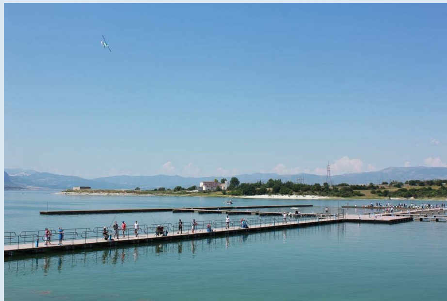
Lake infrastructures at Polifitos