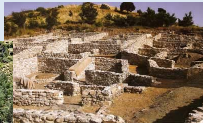
Archaeological Site at "Petres"