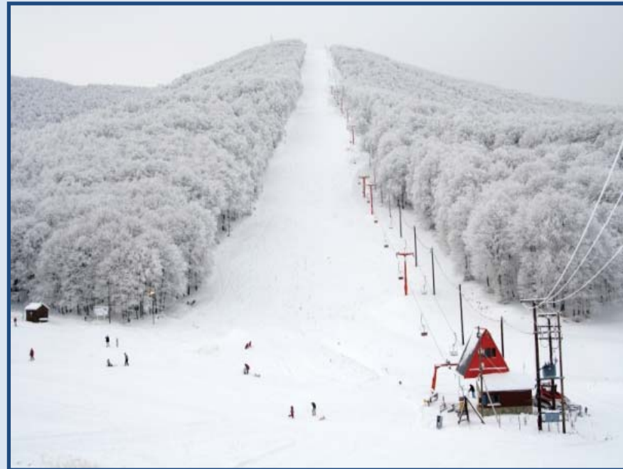
Ski Center at Vitsi