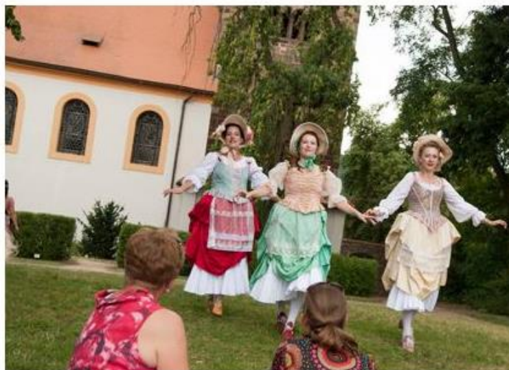
The Czech-Bavarian Baroque Region