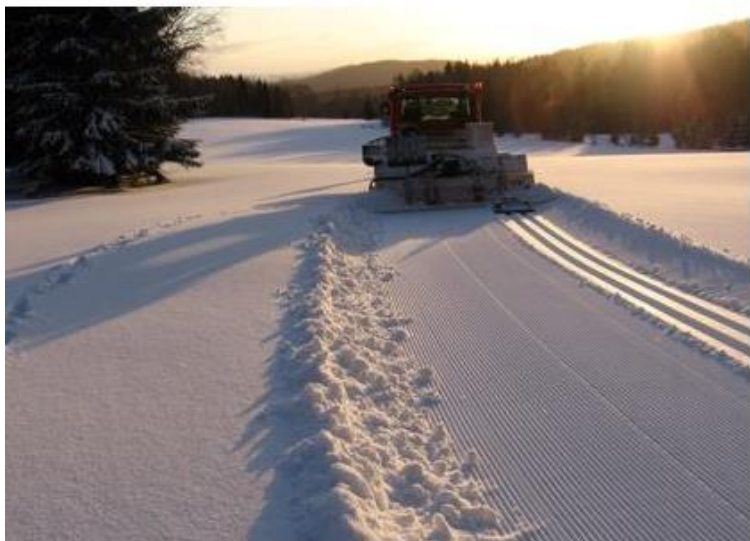
The White Trail of Šumava