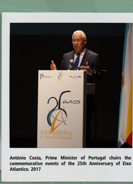
António Costa, Prime Minister of Portugal chairs the commemorative events of the 25th Anniversary of Eixo Atlântico. 2017