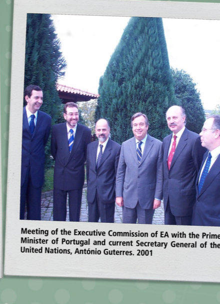
Meeting of the Executive Commission of EA with the Prime Minister of Portugal and current Secretary General of the United Nations, António Guterres. 2001