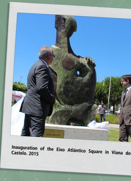
Inauguration of the Eixo Atlântico Square in Viana do Castelo. 2015