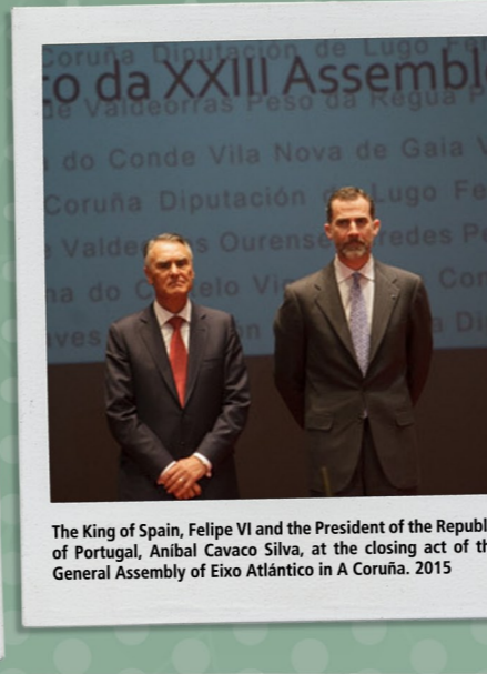
The King of Spain, Felipe VI and the President of the Republic of Portugal, Aníbal Cavaco Silva, at the closing act of the General Assembly of Eixo Atlântico in A Coruña. 2015