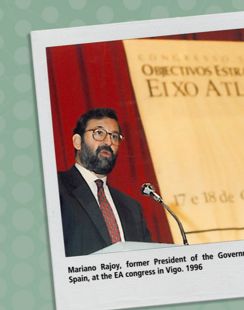
Mariano Rajoy, former President of the Government of Spain, at the EA congress in Vigo. 1996